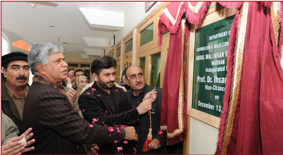
VC while inaugurating Department of Journalism & Mass Communication at Riffat Mahal Campus, AWKUM. Veteran Journalist Saleem Safi is also present on the occasion