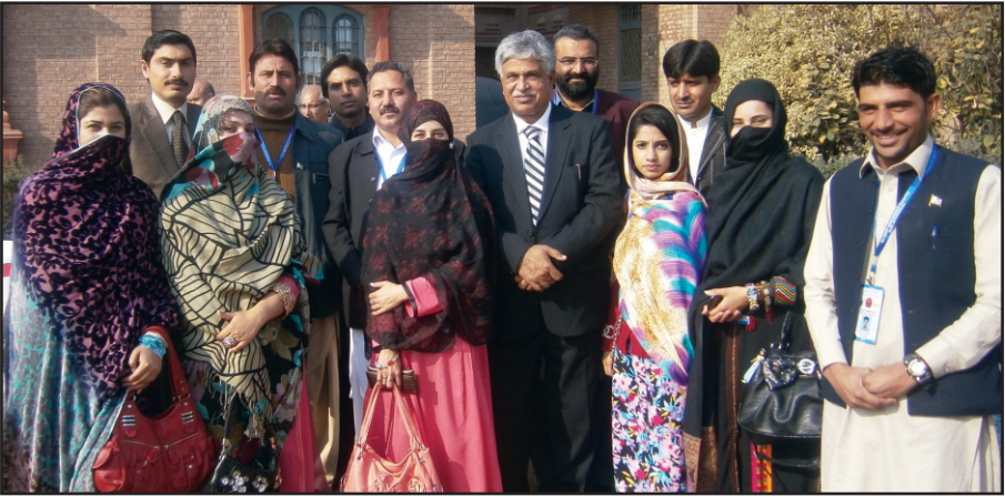
AWKUM: Student of JMC visit to Peshawar Museum along with VC, AWKUM