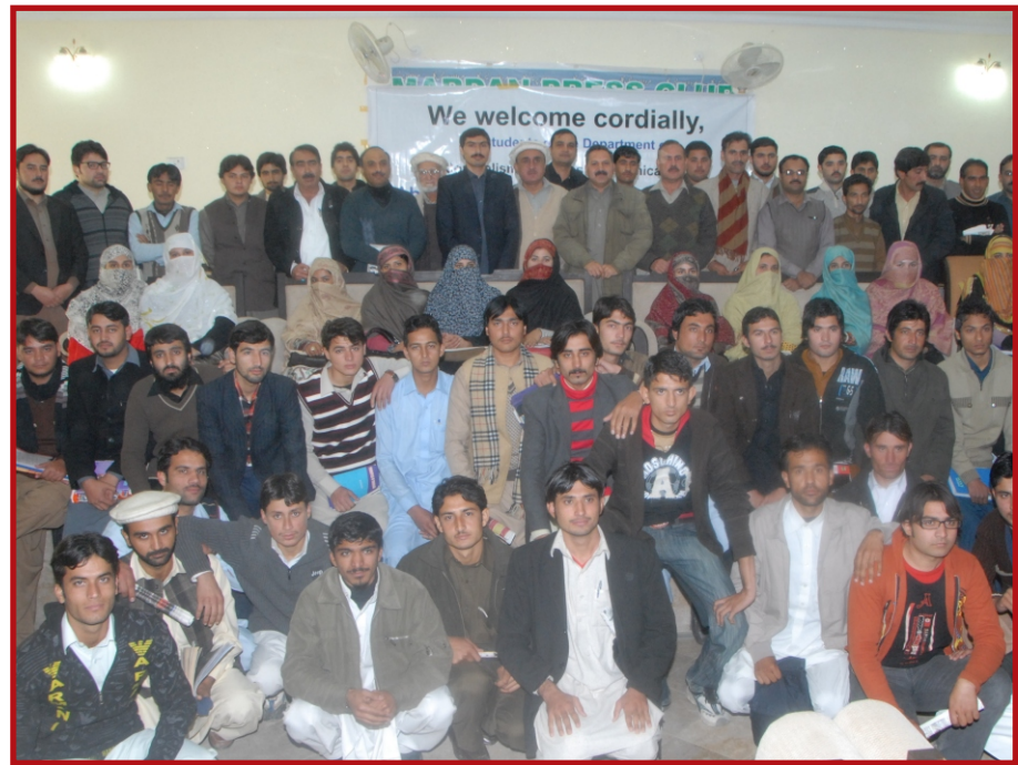
Student of Journalism & Mass Communication visit to Mardan Press Club