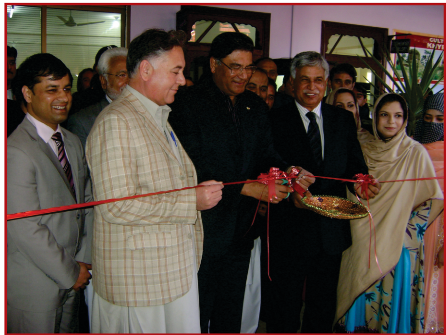
Minister for Sports Syed Aqil Shah while inaugurating Museum at AWKUM

captured. The seventh gallery is represents the vision of Islamic Art Quranic Calligraphy, books, objects of wooden block printings, tiles work and decorative household objects are displayed here. The eighth gallery represents traditional dresses and jewelry. This museum is one of the best in Pakistan in terms of evolutionary descriptions.