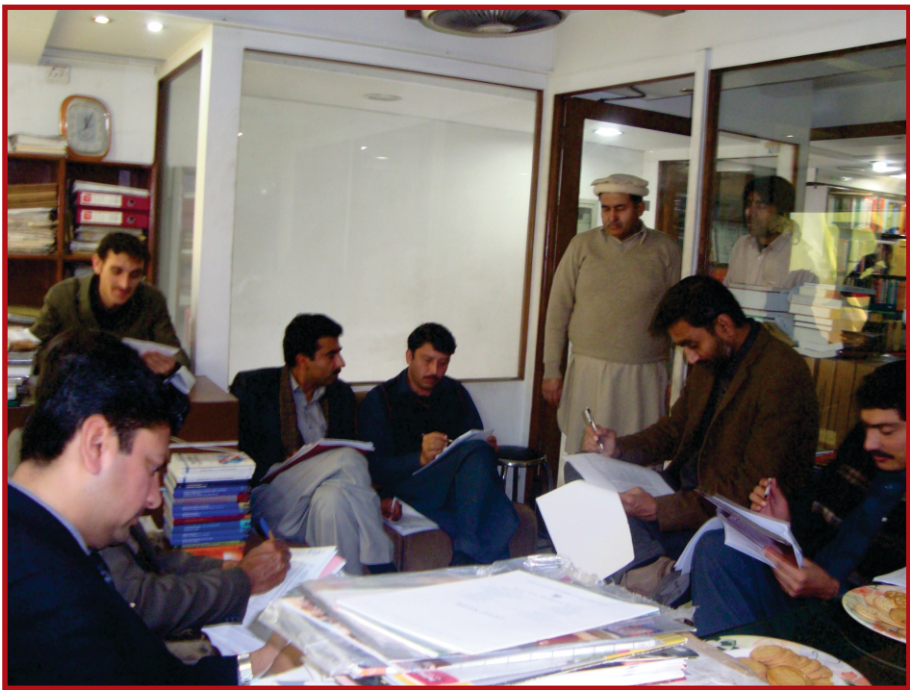
Teachers from Faculty of Social Sciences while choosing books for Library in Lahore